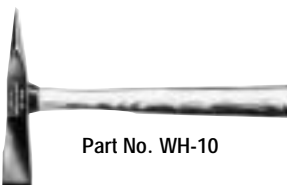
Part No. WH-10