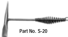
Part No. S-20