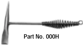
Part No. 000H