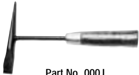
Part No. 000J