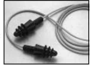
Part No. DPAS30R

SUPERIOR COMFORT: The patented AIRSOFT cushion of air gives far greater wearer comfort than solid stemmed imitators. The AIRSOFT special manufacturing process creates a shell of soft naturally attenuating material around a pocket of air that is comfortable enough for extended usage. HIGH ATTENUATION: The AIRSOFT pocket of air effectively fractures and refracts the sound waves and reduces the sound intensity. AIRSOFT provides the highest rated reusable hearing protector available with an NRR 27.