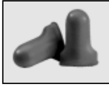
Part No. LPF1

MAX-LITE offers long term user comfort not found in other preshaped foam earplugs. The non-irritating, non-allergenic, self-adjusting foam recovers to fit any ear canal. MAX-LITE is ideal for that portion of the population with smaller ear canals.