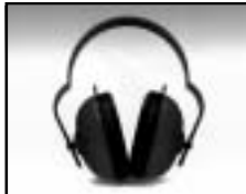
Part No. QM24PLUS

Three position, ultra-lightweight earmuff. Weighing only 6 oz., the QUIET Muff is supplied with an adjustable crown strap for a secure fit when worn behind the head or under the chin. Replaceable ear cushions.