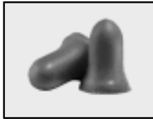
Part No. MAX1

The MAX earplug features a smooth skin for maximum user comfort. Tapered and preshaped, MAX is designed to follow the contour of the ear canal, provide for easy insertion and a comfortable, natural seal. The flared end promotes optimum insertion, depth and easy grasp for removal. HIGH ATTENUATION: The graduated sizing of the cellular cavities effectively fractures the sound waves and reduces the sound intensity. This unique foaming material combined with its unique shape allows MAX to achieve an NRR 33 rating—the highest rated earplug available.