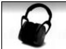
Part No. QM29

Fully dielectric with an extra-long, padded headband for a comfortable fit. Replaceable ear cushions.