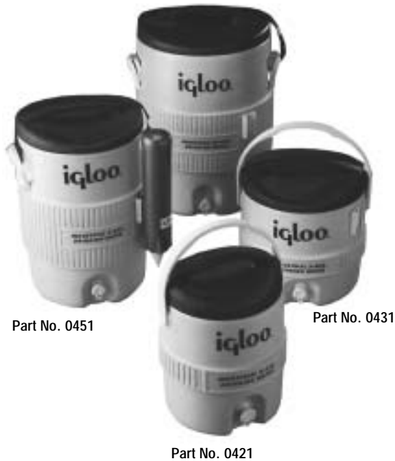
Part No. 0451