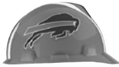
Part No. 818387